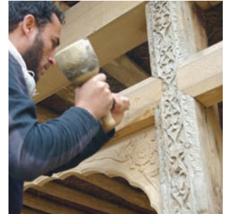
Renovation of the Double Column Serai , Murad Khane

However, three decades of recent conflict has led to extreme poverty, and all but destroyed the crafts industry. After seven years and billions of dollars of international aid, impoverished women and men still have difficulty accessing education, skills training, or sustainable employment. Much of the old city is still deep in garbage, there are few basic services, and historic buildings are collapsing. Afghans need jobs, skills, and a renewed pride in their nation.